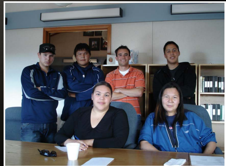
Youth Focus Group - Dettah, NT